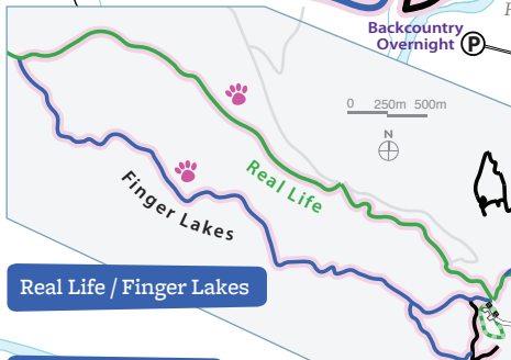
Real Life / Finger Lakes

Real Life and Finger Lakes continuation see inset map.