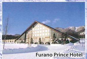
Furano Prince Hotel