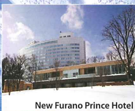
New Furano Prince Hotel