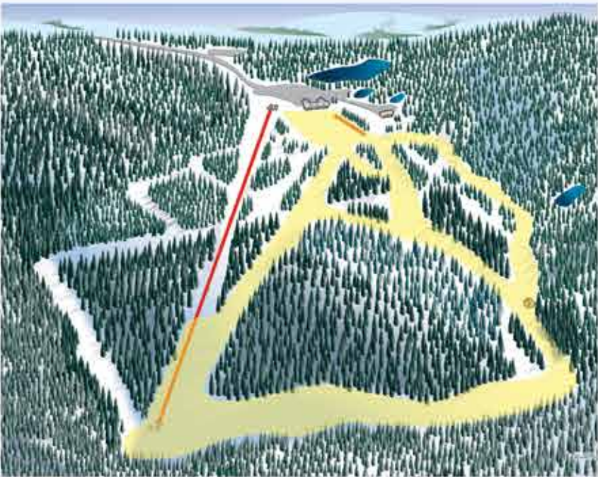
LAUREL MOUNTAIN NIGHT SKIING TRAILS