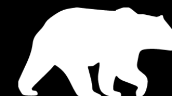
GRIZZLY BEAR URSUS ARCTOS