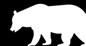
BLACK BEAR URSUS AMERICANUS