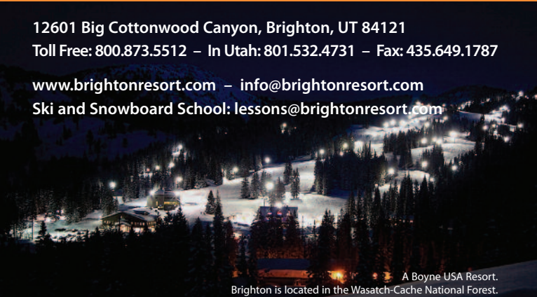
A Boyne USA Resort. Brighton is located in the Wasatch-Cache National Forest.

12601 Big Cottonwood Canyon, Brighton, UT 84121 Toll Free: 800.873.5512 – In Utah: 801.532.4731 – Fax: 435.649.1787 www.brightonresort.com – info@brightonresort.com Ski and Snowboard School: lessons@brightonresort.com