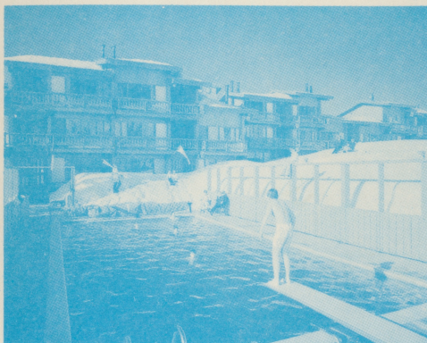
Swimming in the Snow